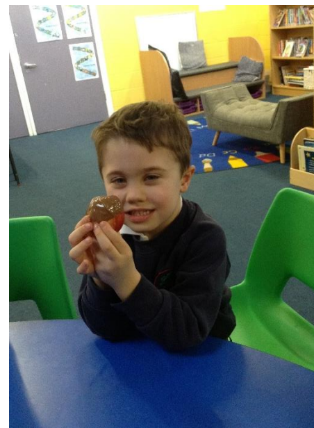
Changing states of material in Willow Class

This year we have had our best ever yet response to our survey, with 43 responses! We very much appreciate the time that you spent and value all your views and feedback. We are very pleased with the high level of confidence you feel in all aspects of the school. Thank you also to those of you who included additional comments or suggestions. These will be noted for further discussion, as we continue to improve.