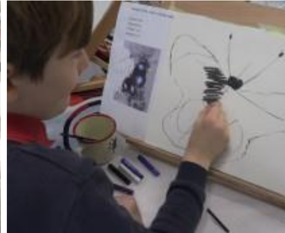
Oak Class Art Curriculum Research Project

Welcome back to the summer term, and it really does feel like summer is on the horizon despite Wednesday's rain. There is a flurry of summer dresses and shorts appearing in school along with essential waterproof jackets and fleeces to match the daily changing weather.