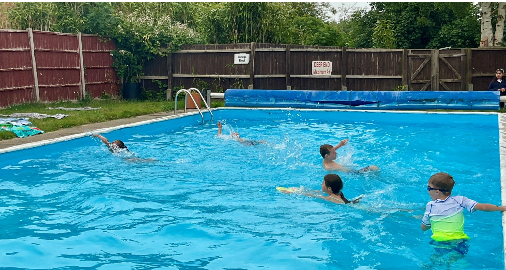
First dip in the pool for Sycamore Class

Our swimming season is now under way and we are delighted to see the children enjoying the pool again. Huge thanks to you and to the HSA Swimming Pool Committee for funding this fantastic resource for our pupils. Our swimming sessions not only help to develop water confidence in preparation for deep water swimming but also develop your child's independence and confidence. Take a look at our Frequently Asked Questions .