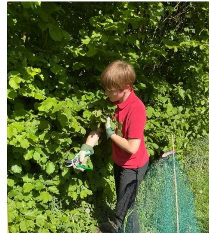
Gardening Club in Action!

This half term, our school value of ' Courage ' will shine through as our pupils - especially our Year 6 students—prepare for their Standardised Assessment Tests (SATs). Over the coming weeks, we will see their determination and resilience in action as they draw on the skills, knowledge, and attitudes they've developed throughout their seven years with us at Hauxton.